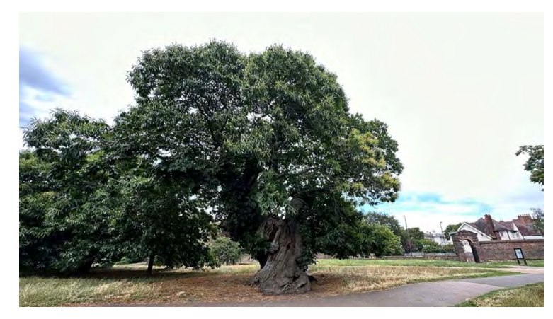
Greenwich Park sweet chestnut, London